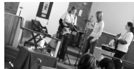
"Band 66" led our worship this time.